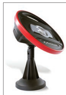
SA881U Magnetic Stand