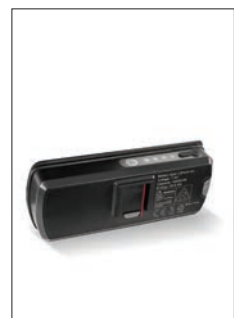
SA880U Additional Removable Battery