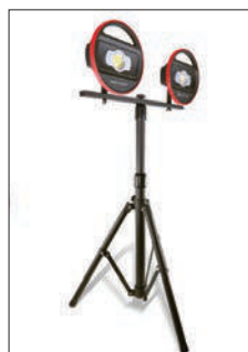
SA882U Tripod Stand (for use with one or two lights)