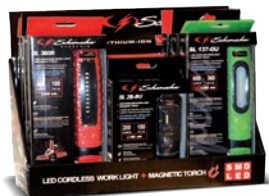
Part Number 143601