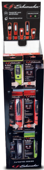
Part Number 143602