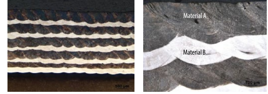
Fig. 4 Switching between two powder gas streams

In the course of automation and with regard to industry 4.0 there is a great demand for machining strategies without tool change. The RPS is the answer to those future requirements: laser cutting, welding and cladding can be realized using only one processing head. Laserfact GmbH has already developed such a processing head – the combi-head – and has successfully demonstrated it at