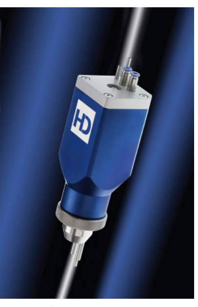
Fig. 2 Rapid-Powder-Switch (pneumatic)

This advanced powder supply is particularly suitable for repair of cracks and pores. So far, there are two methods to process those defects – either the entire surface is milled off and then re-produced applying laser cladding or the flaws are drilled and repaired using pulse coating. While the first method correlates with higher costs, the second method often involves inclusions between the basic material and the filler material, which only become visible