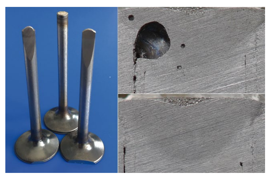
Fig. 3 Powder pulse coating

RPS now offers a third repair method, which surpasses the conventional methods. In the so-called "add-on" mode, heat input takes place through laser radiation on the area to be processed. On a specified time, the powder can then quickly and automat-