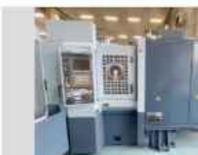
MATSUURA H. PLUS 300 Horizontal machining center