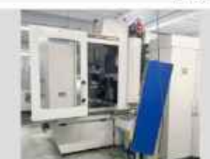
HAUSER S 45-400 CNC jig grinder