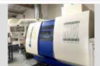
ROLLOMATIC 6000XL Tool & Cutter grinder CNC