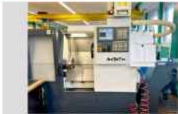
SPINNER TC 400-52