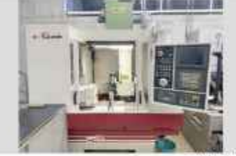
STUDER S 21 LEAN CNC CNC cylindrical grinder