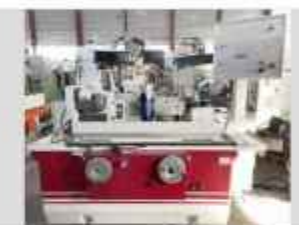
TSCHUDIN HTG 400 Cylindrical grinder