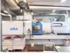
ABA Multiline 2010 Surface grinder