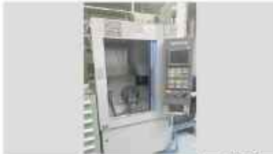
CHIRON FZ 08 KS Magnum 5-axis machining center