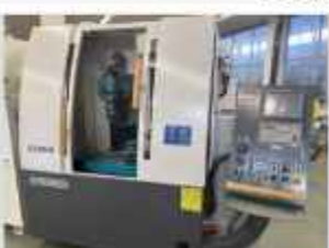
SCHNEEBERGER GEMINI Tool & Cutter grinder CNC