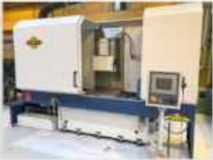
ELB SMART BD10 STC CNC Surface / profil grinder