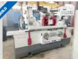
STUDER S 30-1 Cylindrical grinder