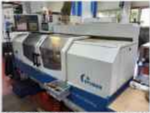
STUDER S 33 CNC CNC cylindrical grinder