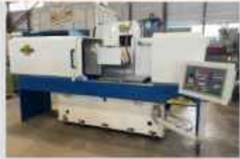
ELB PERFEKT BD 8 SPS Surface grinder