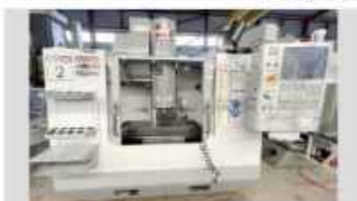
HAAS VF-2 SSHE 3-axis machining center