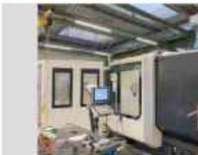
DMG DMC 55H duoB. 4-axis machining center