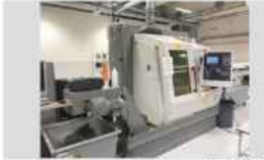
TRAUB TNL 18P