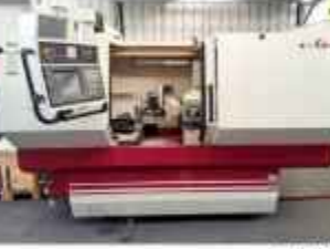
STUDER S145 CNC Internal grinder