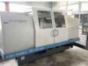
KELLENBERGER KEL-V. CNC cylindrical grinder