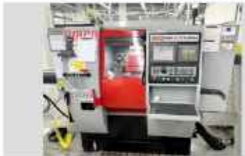
EMCO MAXXTURN 45 SMY