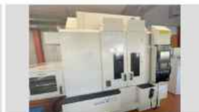
MAKINO V56 A-60 3-axis machining center