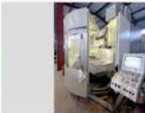
DMG DMU 80 monoBLOCK 5-axis machining center