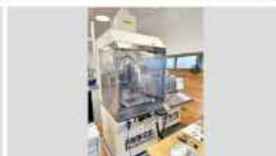
PRIMACON P240 Micro-precision milling cell