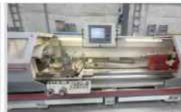
MAS MASTURN 70 CNC