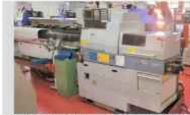
STAR SR-10 J type C