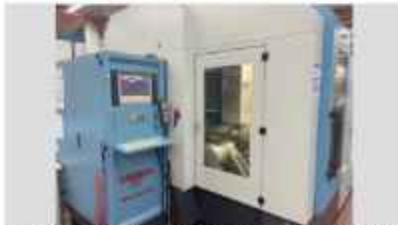
RÖDERS RFM 600 DSP 5-axis machining centre