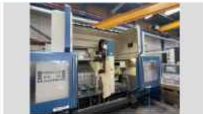
HEDELIUS RS 60 3 + 5-axis machining center