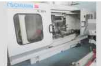
TSCHUDIN PL 105 A CNC cylindrical grinder