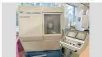
WILLEMIN MAC. W 401S 3-axis machining center