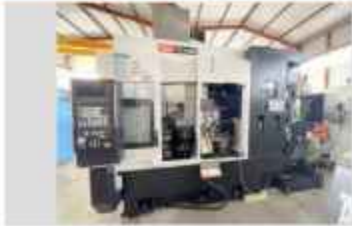
MAZAK IVS 200 M