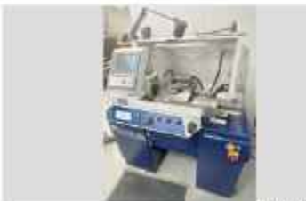
SCHAUBLIN 102 TM CNC