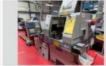
STAR SR-20 R