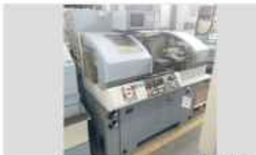
SCHAUBLIN 125 CCN