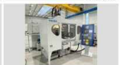
HAUSER S 35-400 CNC jig grinder