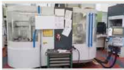
MIKRON UCP 600 VARIO 5-axis machining center