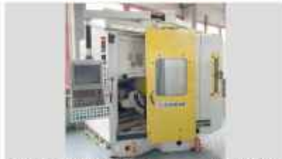
C.B.FERRARI ML 45 5-axis machining center