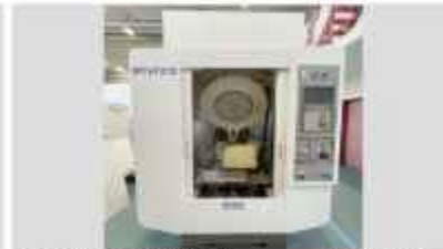
MIYANO MTV-T310 5-axis machining center