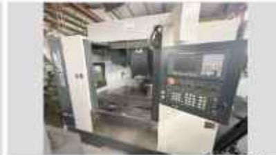
SYNTAK MBV-10 5-axis machining center