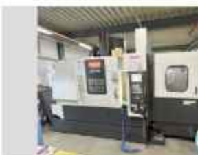
MAZAK NEXUS 510C 3-axis machining center