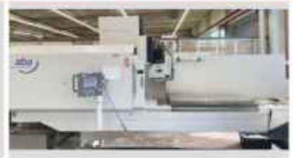
ABA MULTILINE 1507 A Surface grinder