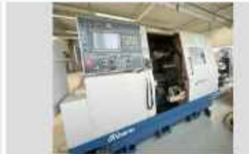
MIYANO BNE-51 S5