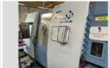
SCHAUBLIN 65 TM-6Y