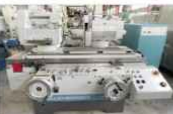
KELLENBERGER 600-U Cylindrical grinder