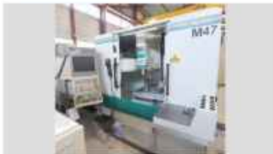
FEHLMANN PM. 60-HSC 5-axis machining center