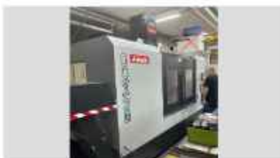
AWEA BM-1400 4-axis machining center