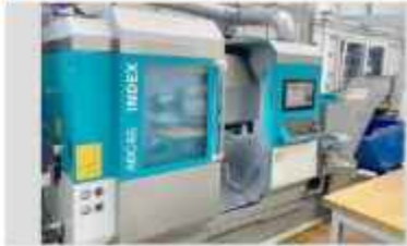
INDEX ABC 65