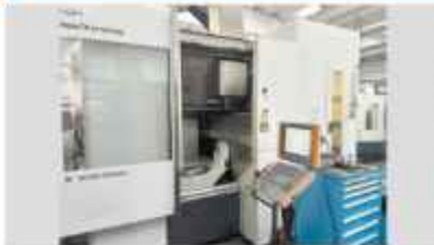
MIKRON HPM 800 U 5-axis machining center