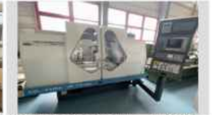
KELLENBERGER KEL-V. CNC cylindrical grinder