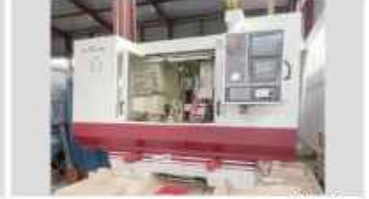
STUDER S 31 LEAN CNC CNC cylindrical grinder