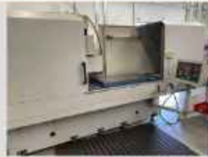
ELB PERFEKT BD Surface grinder