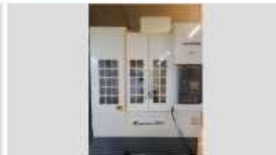
KITAMURA MyCenter-2XIF 4-axis machining center