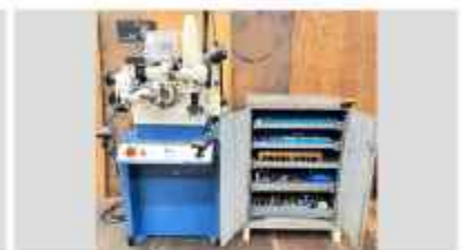
EWAG WS 11 Tool and cutter grinder