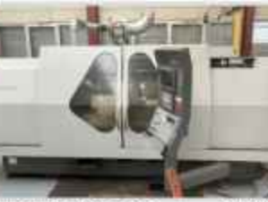
KELLENBERGER KEL-V. CNC cylindrical grinder