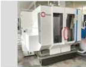
HERMLE C 800 U 5-axis machining center