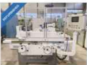
KELLENBERGER 600 U Cylindrical grinder