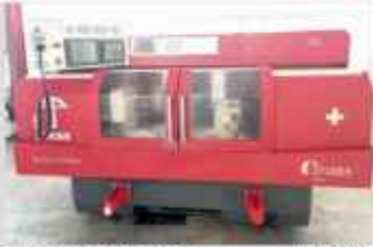
STUDER S 33 CNC CNC cylindrical grinder