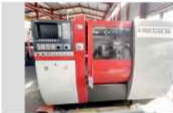
EMCO Emcoturn 365