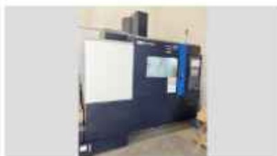
HWACHEON VESTA 1000 4-axis machining center