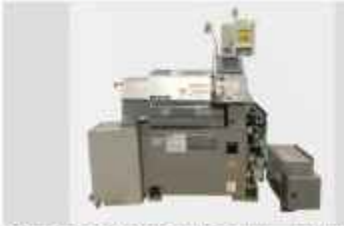
CITIZEN CINCOR R 07 VI