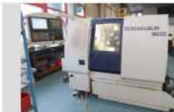
SCHAUBLIN 140 CNC