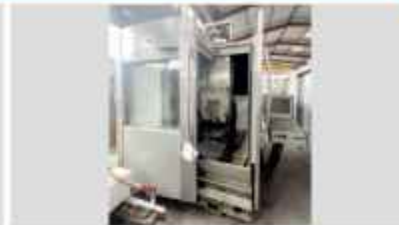
DMG DMC 75 V linear 5-axis machining center