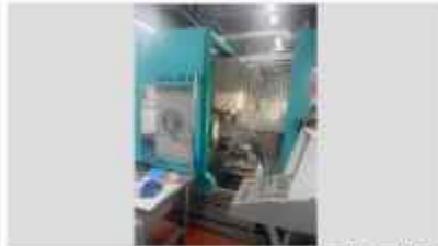
DMG DMU 50 V 5-axis machining center