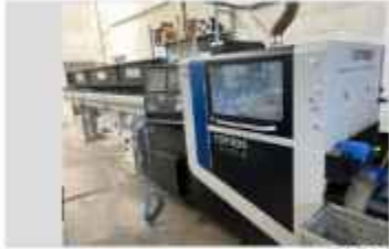
TORNOS DT 26