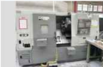
HYUNDAI KIA SKT 210SY