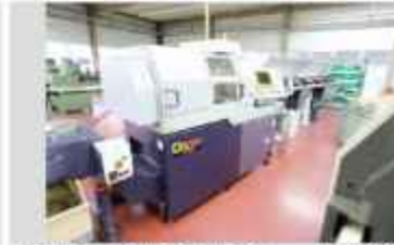
CITIZEN CINCOR L 20