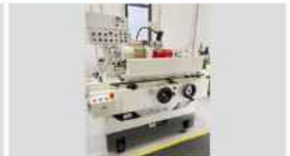
STUDER S 20-2 Cylindrical grinder