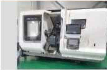
DMG MORI NZX 1500