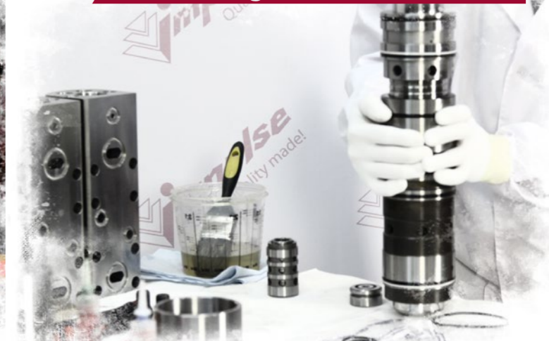
Intermediate control at all stages