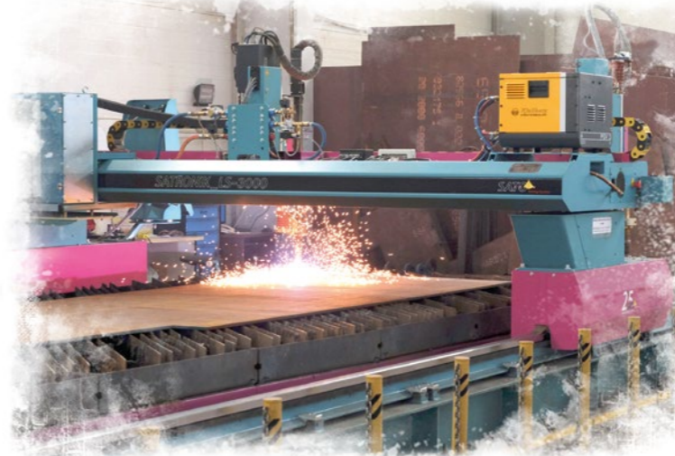
Three modern plasma & gas-cutting machines