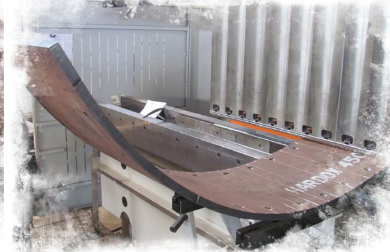
600 tons sheet bending press