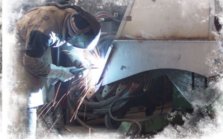
Only US welding machines